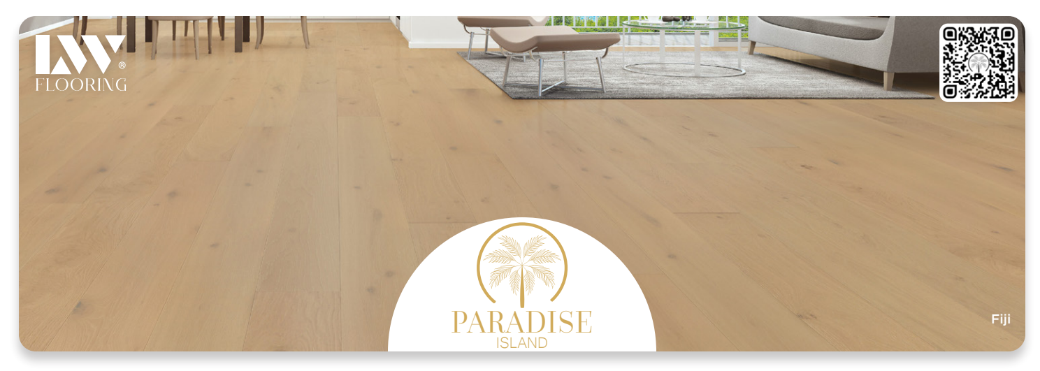
The Paradise Island Collection is a true masterpiece that can transform any space with its elegant refinement, natural beauty and sophistication. Featuring 10-1/4" wide European Oak planks 5/8" thick and up to 86-5/8" in length along with a 4mm wire-brushed veneer, this collection is the perfect union of nature's splendor and human artistry. From the shoreline to the ridgeline- Paradise Island is at home anywhere.