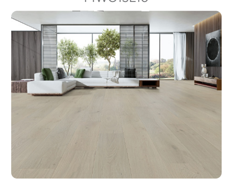
Oahu PIWO15O10 Page 1 of 2