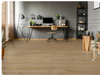
Monument Valley GN6MV9