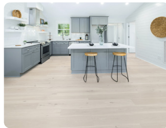
Luray Caverns GN6LC9