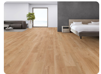
Minnehaha Falls GN6MF9