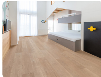
Prismatic Spring GN6PS9