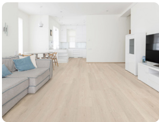
Agate Beach GN6AB9

With extremely low repeat, durability, and fully waterproof, this collection features 3D Direct Digital Printing technology, and offers the best features of RCV, WPC, and Laminate flooring, plus an unsurpassed visual.