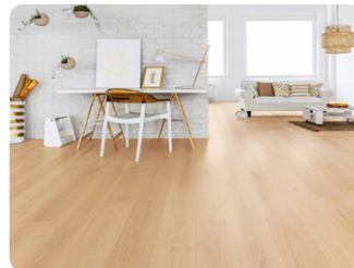
Niagara Falls GN6NF9