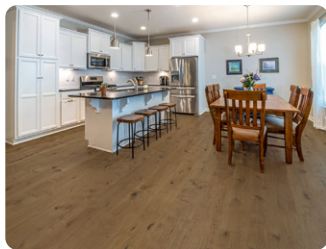
Santa Elena GN6SE9