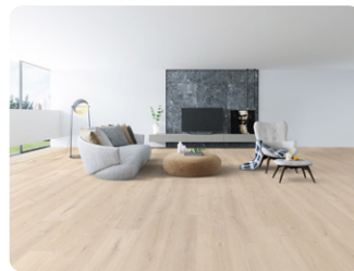
Smoky Mountains GN6SM9