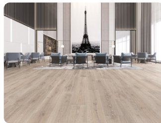
Spire Cove GN6SC9