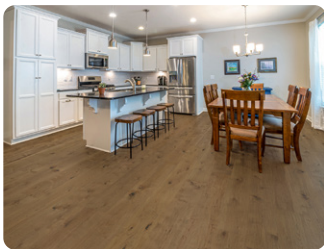
Santa Elena GN6SE9