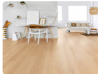
Niagara Falls GN6NF9