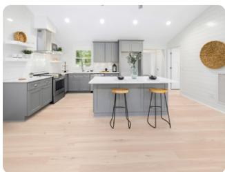
Luray Caverns GN6LC9