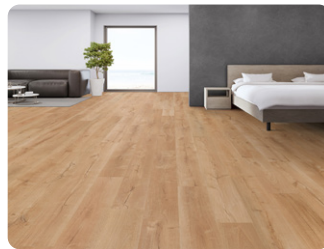
Minnehaha Falls GN6MF9