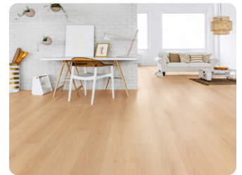
Niagara Falls GN6NF9