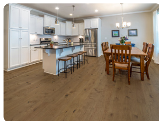
Santa Elena GN6SE9